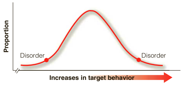
FIGURE 1:1 Statistical deviance model of disorder.

From a sociocultural norm perspective, children who fail to conform to age-related, gender-specific, or culture-relevant expectations might be viewed as challenging, struggling, or disordered. Keep in mind, however, that there is significant potential for