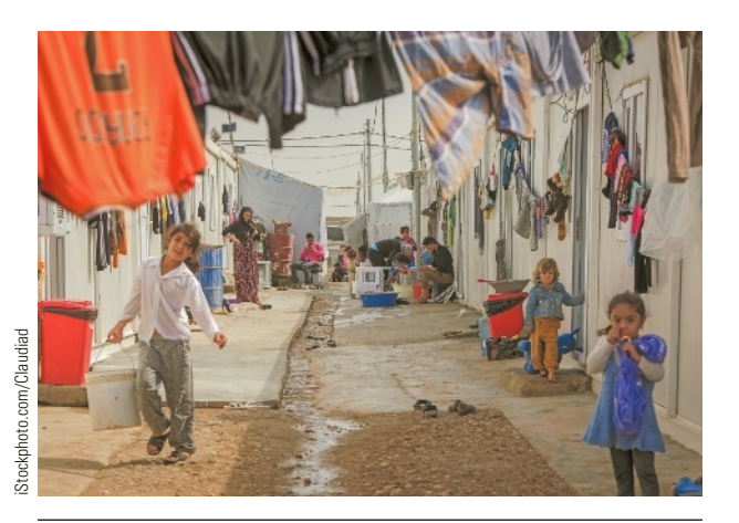
Far too many children experience displacement, hardship and loss; the negative impact on physical and psychological well-being is enormous.

We must also emphasize that, across the globe, millions of children are struggling in the face of unimaginable trauma, including exposure to disease and death, armed conflict, abandonment and homelessness, and dislocation (Omigbodun, 2008; Vostanis, 2012). These terrible situations require increased awareness, advocacy, and a responsibility to provide interventions to